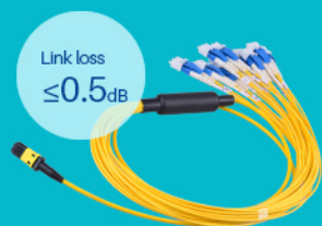
MTP/MPO Harness Cable