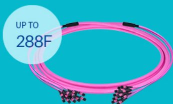
MTP/MPO Trunk Cable